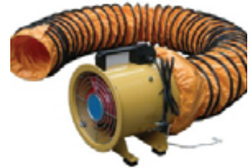
Fan supplied with 5m duct complete.